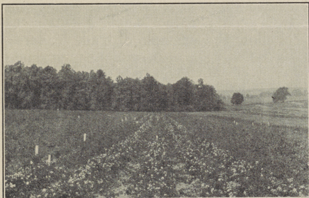
"Sit up and take notice" say these climbing Roses